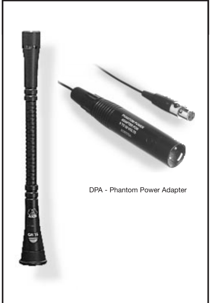
DPA - Phantom Power Adapter